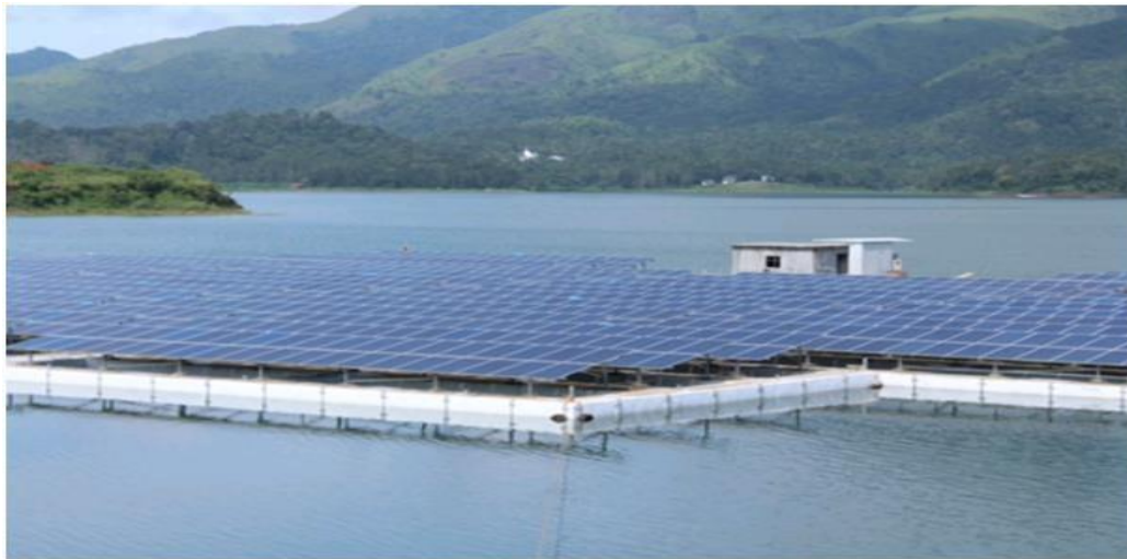
Fig -1: Layout of floating solar power plant

This fusion of new concept consists of floating system which is a floating body (structure + floater) that allows the installation of the PV module, PV system i.e. PV generation equipment, similar to electrical junction boxes, that are installed on top of the floating system and underwater cable which transfers the generated power to the pv system development.