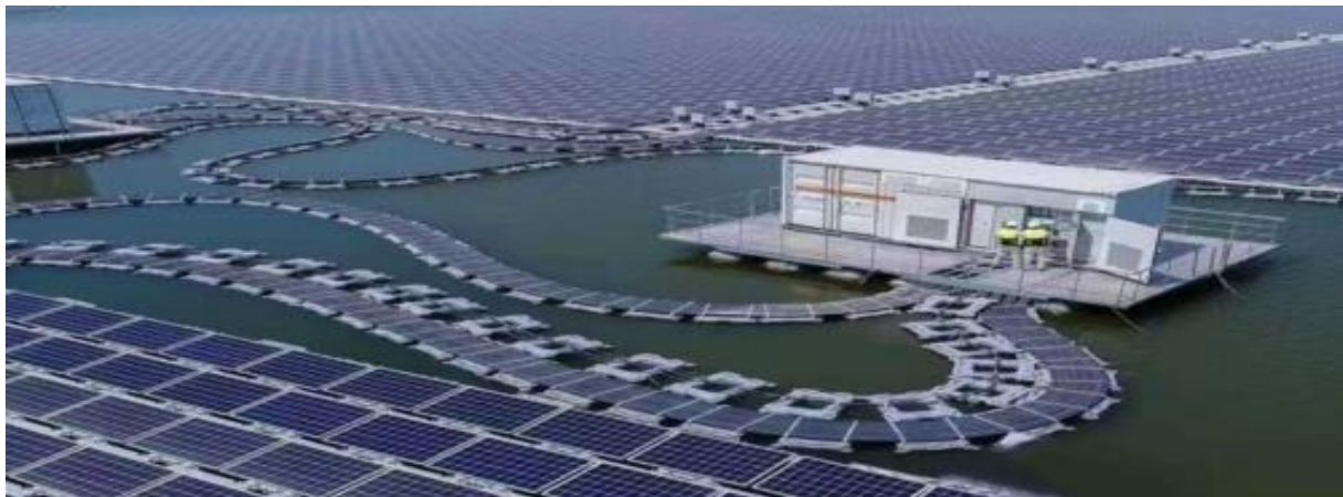
Fig - 4: Floating Power Plant

Solar Module - It is PV Generation equipment, similar to electric junction boxes, which are installed on top of the floating system. A single solar module can produce only a limited amount of power; most installations contain multiple modules. A photovoltaic system typically includes a panel or an array of solar modules, a solar inverter, and sometimes a battery and/or solar tracker and interconnection wiring. Mostly crystalline solar PV modules have been used for the floating solar systems.