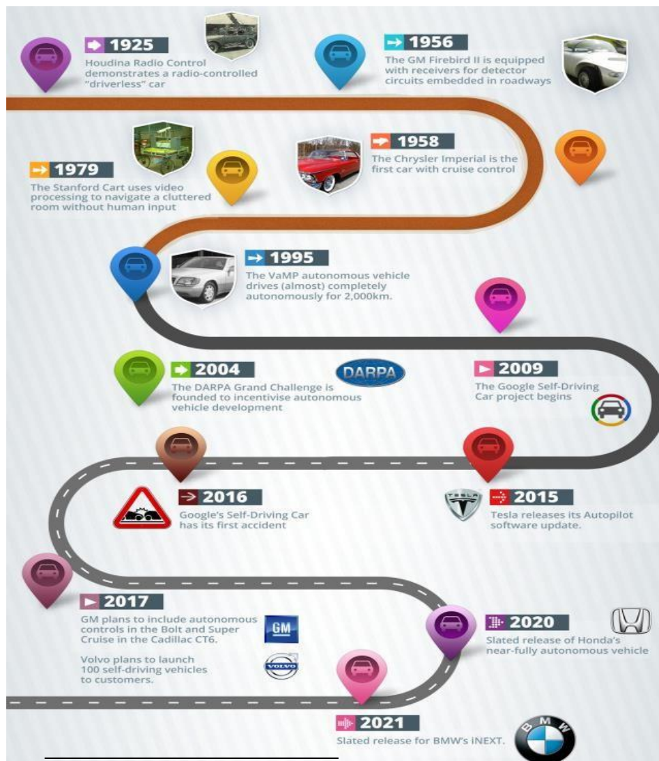
Fig 1. evolution of self-driving cars