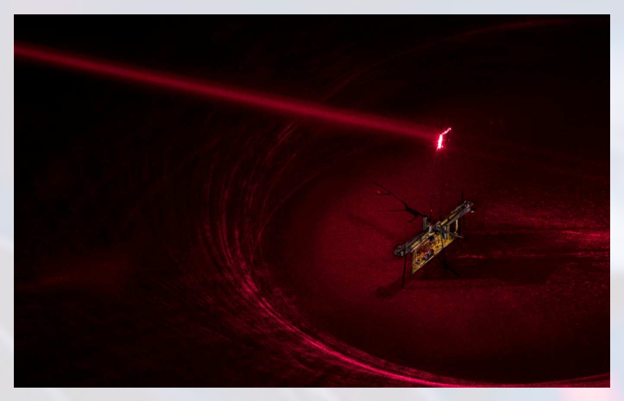
Fig 2 Laser light bathes a photovoltaic cell, providing RoboFly with the power to take flight.

Tiny, highly maneuverable robots like RoboFly could quickly flutter into crevasses where bigger aerial drones simply wouldn't fit. One possible task for future versions of RoboFly could draw even more inspiration from flies — particularly, their talent for tracking down "smelly things,"