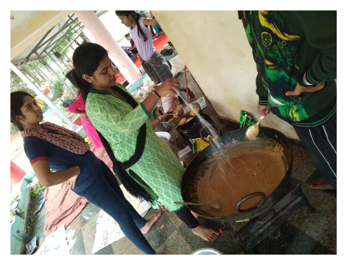
The Kitchen Team of that day i.e Team Beta preparing Lunch

On one side the Kitchen Team was busy in preparing food, the Community Service Team on the other side was engaged in conducting sports for the children of the Ashram.