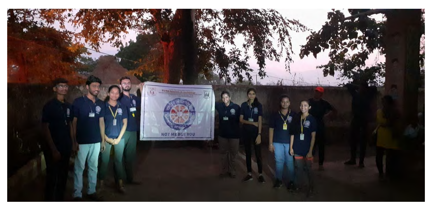
Street play on PRADHAN MANTRI GRAM SADAK YOJANA performed by the NSS Volunteers in the District Council School.

A detailed way of how one can get in contact and get access to the schemes was very cleverly depicted by the volunteers through this street play. At the end of the day the volunteers showcased their hidden talents by performing various activities. These performances included dance, singing, poetry recitation, qawwali, stand-up comedy and many more.