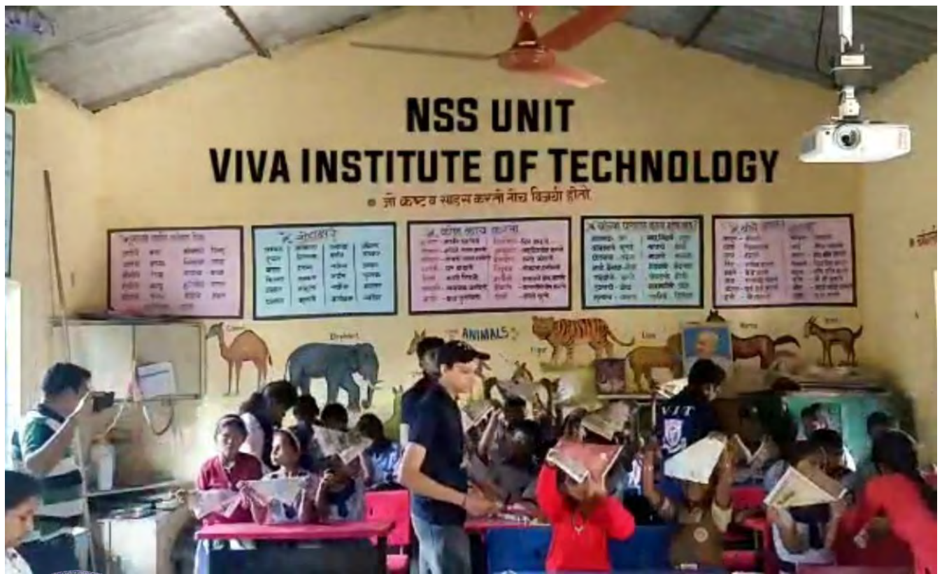
The NSS Volunteers teaching Origami to the students of the District Council School.

On the 5th day i.e. 28th December 2019, Viva Institute of Technology conducted a playful origami workshop and sports and other activities for the students of the District Council School. The students were taught the many ways in which a normal paper can be used productively through origami. A sports session was also conducted for the students which included games like cricket, one leg race and other fun games. This session was conducted to improve the children's creativity and productivity. This session also emphasized on reusing waste papers creatively. A normal newspaper could be turned into a stationary holding box, or even a pouch that could easily carry weight of a minimum of a kilogram. It invoked in the children a sense of creativity, blue-sky thinking, innovatory ideas and ingenious ways to contribute to the society.