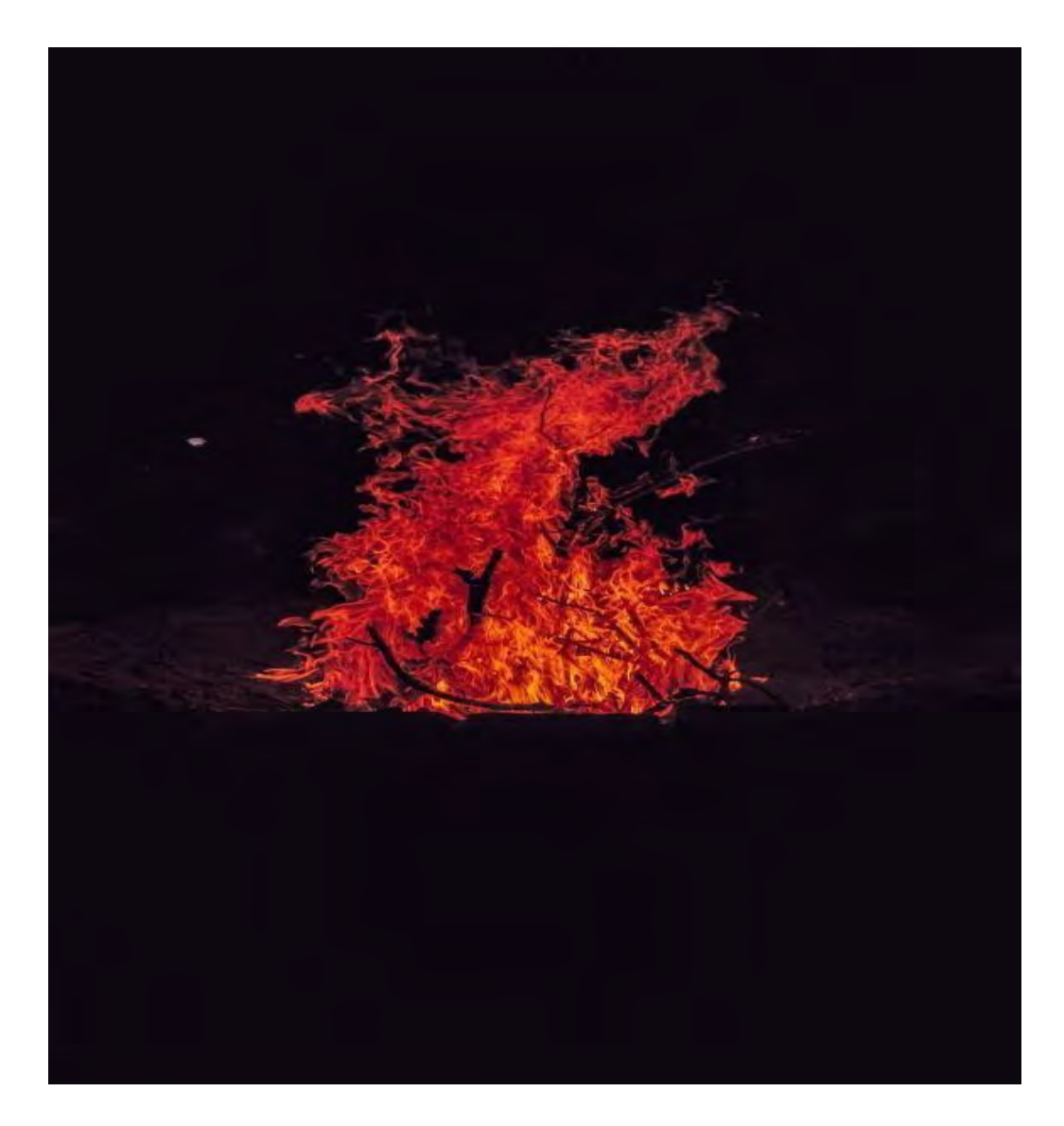
Camp fire lit up by the NSS volunteers of all teams together

After all the activities for the day, the volunteers took a little bit of rest and had their dinner earlier than usual around so that everyone could enjoy the camp fire night and the second last day ended with everyone enjoying the warmth of the fire on a cold winter night.