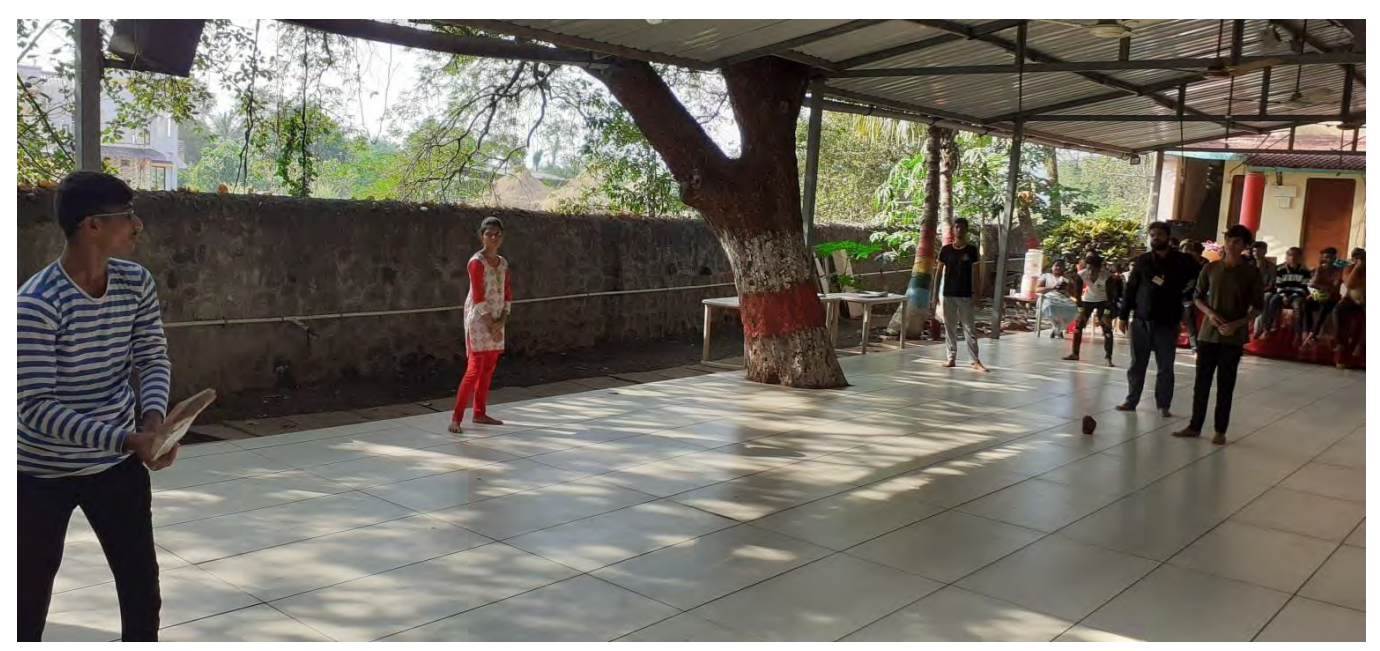
The NSS volunteers actively participating in the sports conducted by the Programming officer.

After having lunch, sports and games session was conducted for the NSS volunteers. This session included games like cricket, dodge the ball, one leg race, volleyball, etc. This session acted as a stress buster for everyone. The volunteers were very much refreshed and it eventually boosted the volunteers' energy to do more work in the forthcoming days.