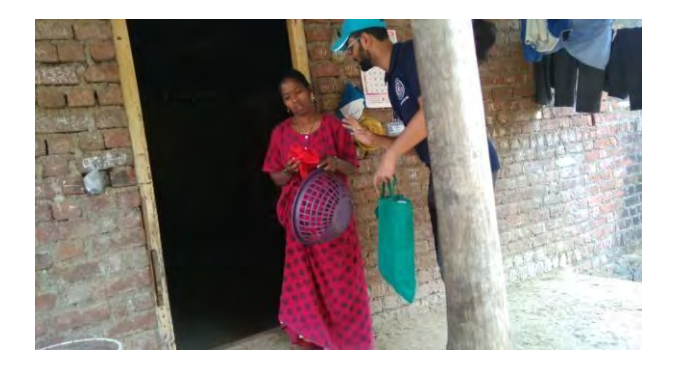
Distribution of handmade cloth bags during the rally by the NSS Volunteers