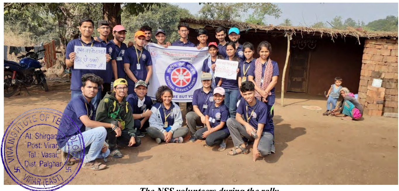
The NSS volunteers during the rally

This 7 day camp was not only beneficial for the people of the village but also for the NSS volunteers. On one side as the villagers were being made aware of various issues, diseases and importance of various social aspects, the volunteers on the other hand learned a lot regarding interaction with different kinds of people, the societal issues that existed which some of them weren't even aware of, a sense of gratitude, togetherness, rural hospitality, self development and most importantly a sense of completeness that one gets each time they do social service in any form.