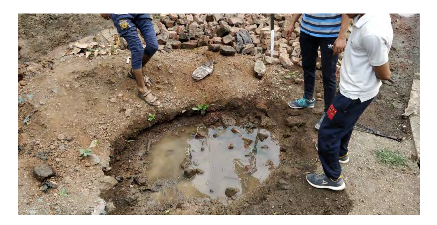
The members of Team Beta successfully dug a hole for the ease of the villagers

Digging a hole was a big task but the volunteers worked hard to complete the work on time which eventually taught all the volunteers the importance of time management combined with hard work.