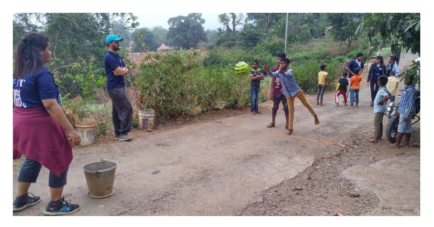
Glimpse of a game organized for the children

Games like running, book balancing, throw ball, basketball, etc were organized by the NSS volunteers for the children. The children enjoyed a lot playing all the games. In the end all the top players were rewarded with gifts and in fact every child was provided with a reward.