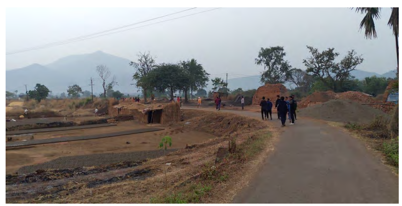
All the NSS volunteers going for the morning jog

On 30th December 2019, 7th day of the camp, the morning routine was followed as per the schedule like the previous 6 days. This included health and fitness session which consisted of a 1-hour yoga session followed by 30-min exercise.