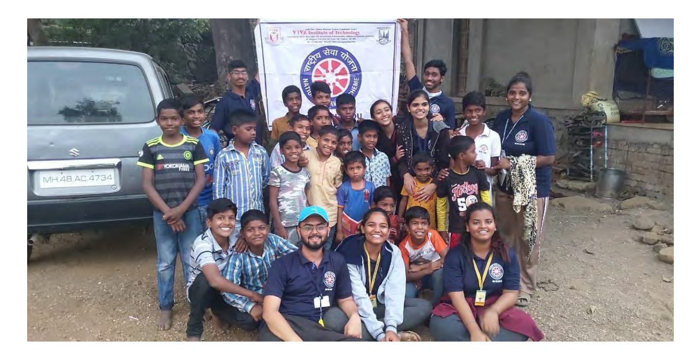
NSS volunteers of Team Alpha with the children of the Asharam

The third team, i.e. the team performing street play(team Gamma) had to clean the premises first and then practice for their play. Since it was the day of campfire, the team also had to dig up a small pit for placing the bonfire.