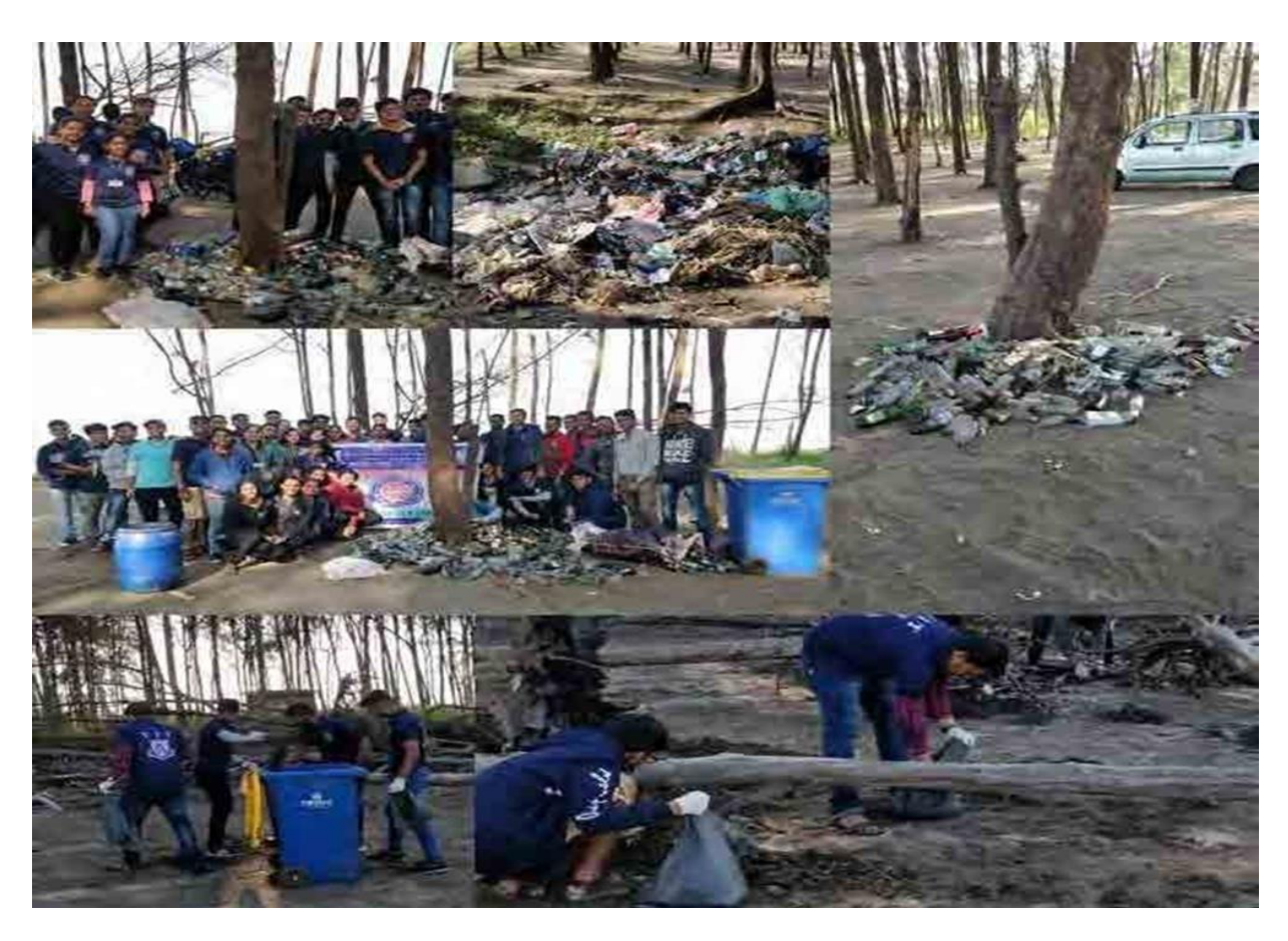
At: Shirgaon Post Virar, Tal.: Vasai, Dist. Palghar

VIVA Institute of Technology and NSS unit successfully completed Beach Cleaning at Bhuigaon Beach on <u>8th January 2020</u>. There were volunteers present for the event. The cleaning was conducted from 7:30 AM to 10:30 AM. The volunteers were instructed to reach Vasai Railway Station at 7:00 AM and from there on the volunteers reached the location by rickshaw within 20 minutes. A major amount of waste that was collected from the cleaning consisted of polythene bags, food wrappers and glass bottles. Different types of waste that were abandoned, dumped and buried deep into the sands were carefully removed, handled and properly collected by the volunteers. Some of these wastes were very difficult to remove indicating the long period of time for which the waste was buried into the sand. The polythene bags that, at the first instance, looked easy to remove from the surface itself, was actually just 5% of what was entirely and deep-rootedly buried. Unfortunately, wastes like these could not be fully removed, given the depth at which they had sunk into the sand. Instances like these made the volunteers even more aware of the dire fact that beach cleaning was a very important need of the hour.