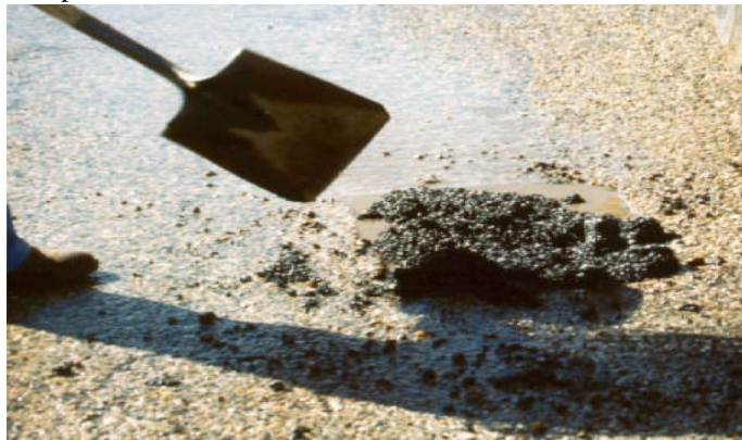
Fig. no.03:- Throw and roll

Throw-and-roll method is one of the oldest and simplest pothole repairing method. It is a temporary repair and done where the conditions are unfavourable: wintry or watery conditions. It can be performed on wet potholes but has a better repairing effect when done on dry potholes. It is used very commonly in India because of its speed and simplicity. Hot or cold patch material is placed in the pothole, and then the patch is compacted with a roller. Throw-and-roll method is cost effective and quick but it doesn't provide a longlasting repair. One difference between this method and the traditional throw-and-go method is that some effort is made to compact the patches. Compaction provides a tighter patch for traffic than simply leaving loose material. The extra time to compact the patches (generally 1 to 2 additional minutes per patch) will not significantly affect productivity. This is especially true if the areas to be patched are separated by long distances and most of the time is spent traveling between potholes.