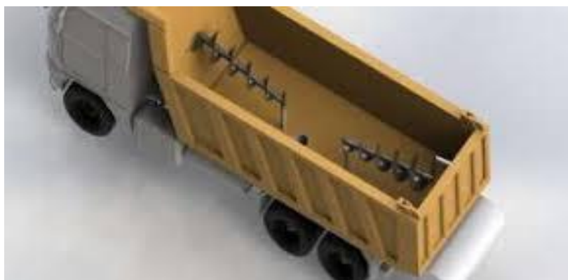
Fig.no.06:- Modified Pothole filler truck

On Indian roads, conventional pothole filler trucks can be made efficient by making few modifications in the trucks. Apart from a hole in its base and a roller at its rear, two mixer blades are added and can provide a good quality mixture of asphalt and aggregate. Pothole filling truck works on the throw-and-roll method. The only difference: manual throwing of patch material is replaced by filling the pothole with a truck directly, by the hole provided in its base. It can also be automated by using ultrasonic sensors to detect the irregularities on the surface of the road, and of those irregular surfaces, the ones with high difference with mean level of the road can be detected and filled automatically. The quantity of the patch material can also be governed with the help of sensors.