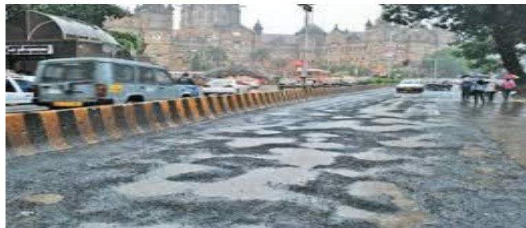
Fig no.1:- Potholes on Indian road

A hole in a road surface that result from gradual damage caused by traffic or weather. A pothole is a hole in the roadway pavement that vary in size and shape. A deep natural underground cave formed by the erosion of rock, especially by the action of water or a depression or hollow in a road surface caused by wear or subsidence. Introduction to potholes in India is very common due to poor drainage system & poor quality of materials been used to repair it. The structural failure in pavement is mainly because of water below the structure of roads. Once the crack is developed water may enter it and deteriorate the materials of pavement. Quite often, potholes are repaired with antiquated techniques such as placing soil or bare aggregate, bitumen in the pothole because no hot mix asphalt is available during monsoons. Nowadays, the most common method is the pothole filling truck. This truck is equipped with a roller at its rear end and a hole in its base, which supplies the asphalt-aggregate mixture for filling the pothole.