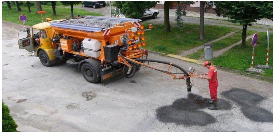
Fig. no.04:- Spray Injection