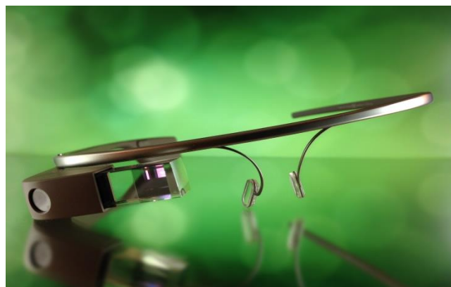
Fig.2 Google glass

Google Glass is used overlapping with a smartphone and is one of the tools it uses to display notifications correctly and quickly [5][11]