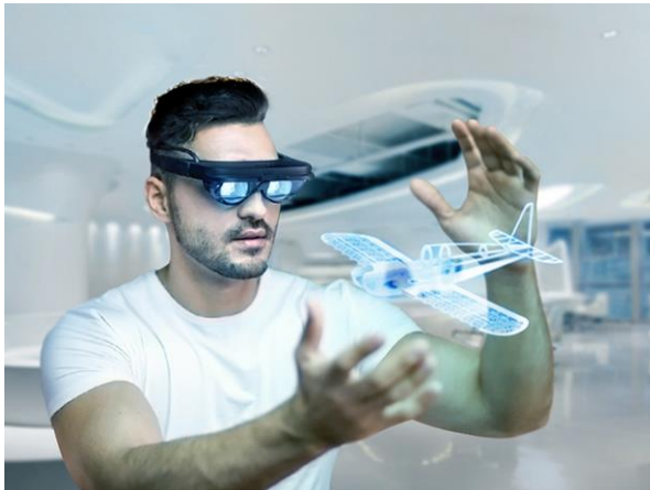
Fig. 4 Augmented reality of smart glasses

The earth is being improved or supplemented with material. In these the user can see the real world but also find the visual content created by the computer device and displayed with an additional light source that does not allow the real world view. Connecting to those objects is a way of communicating with computer devices. An example of additional additions is Microsoft hololens. [13]