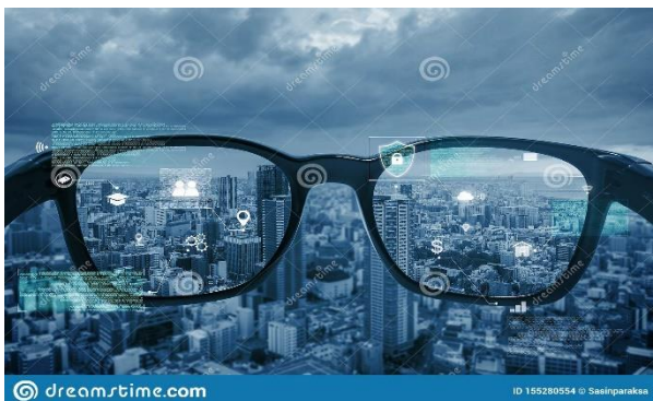
Fig. 5 Virtual reality of smart glasses

The ultimate goal is to create a fully visible world for the user to see, share and immerse in the visible world. The user sees only this visible world, and any other light sources do not touch the eye. One noticeable difference in the simple screen is that user actions affect the physical world. For example the movement affects user content that you will be able to see. The latest example of virtual reality is the play channel. [13][7]