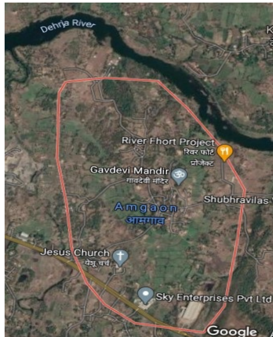
Study area-Amgaon map