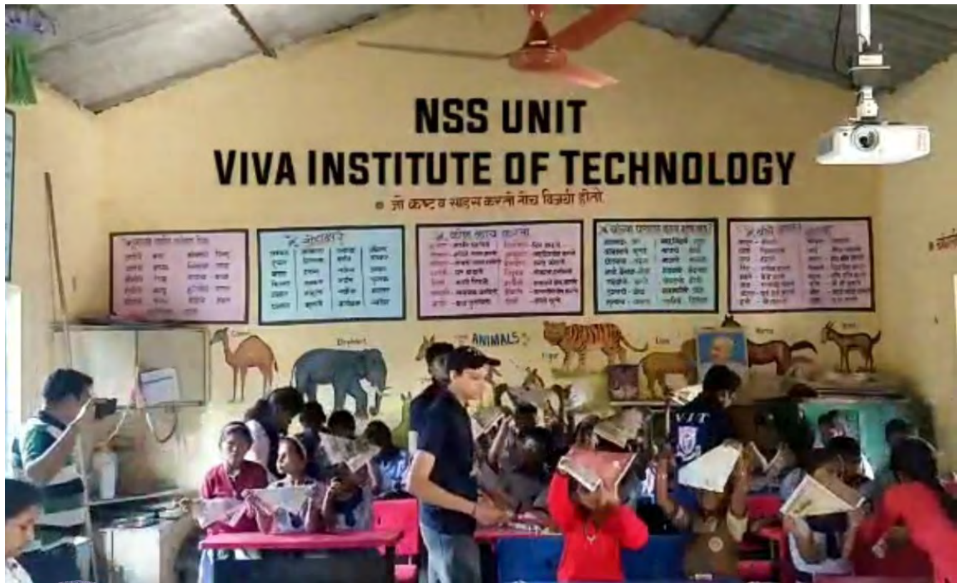
The NSS Volunteers teaching Origami to the students of the District Council School.

On the 5th day i.e. 28th December 2019, Viva Institute of Technology conducted a playful origami workshop and sports and other activities for the students of the District Council School. The students were taught the many ways in which a normal paper can be used productively through origami. A sports session was also conducted for the students which included games like cricket, one leg race and other fun games. This session was conducted to improve the children's creativity and productivity. This session also emphasized on reusing waste papers creatively. A normal newspaper could be turned into a stationary holding box, or even a pouch that could easily carry weight of a minimum of a kilogram. It invoked in the children a sense of creativity, blue-sky thinking, innovatory ideas and ingenious ways to contribute to the society.