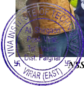
NSS volunteers of Team Alpha during community service in the ashram.