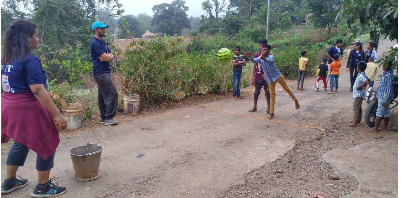
Glimpse of a game organized for the children

Games like running, book balancing, throw ball, basketball, etc were organized by the NSS volunteers for the children. The children enjoyed a lot playing all the games. In the end all the top players were rewarded with gifts and in fact every child was provided with a reward.