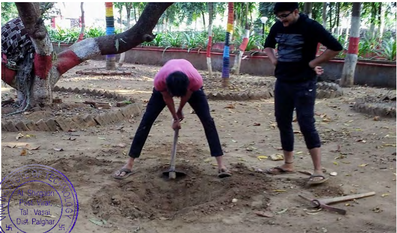
Team Gama digging pit for Campfire

The third team, i.e. the team performing street play(team Gamma) had to clean the premises first and then practice for their play. Since it was the day of campfire, the team also had to dig up a small pit for placing the bonfire.