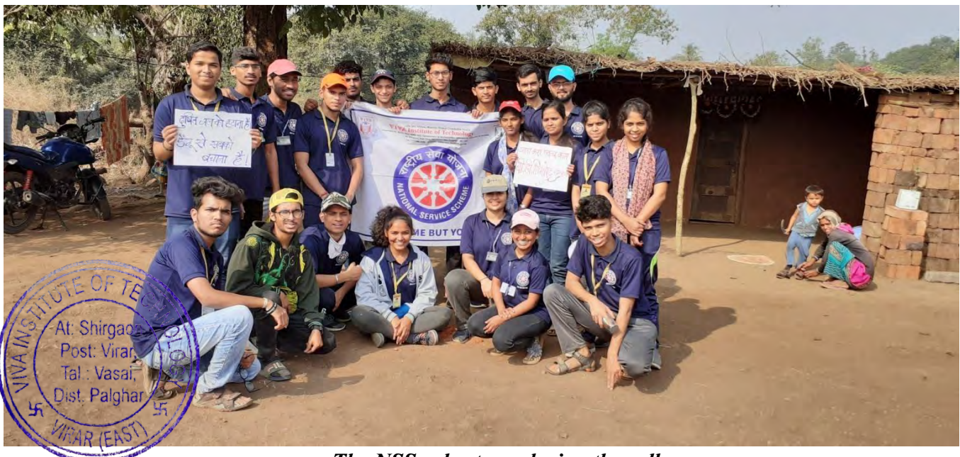
The NSS volunteers during the rally

This 7 day camp was not only beneficial for the people of the village but also for the NSS volunteers. On one side as the villagers were being made aware of various issues, diseases and importance of various social aspects, the volunteers on the other hand learned a lot regarding interaction with different kinds of people, the societal issues that existed which some of them weren't even aware of, a sense of gratitude, togetherness, rural hospitality, self development and most importantly a sense of completeness that one gets each time they do social service in any form.