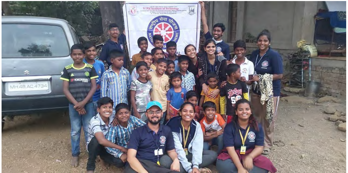
NSS volunteers of Team Alpha with the children of the Asharam

The third team, i.e. the team performing street play(team Gamma) had to clean the premises first and then practice for their play. Since it was the day of campfire, the team also had to dig up a small pit for placing the bonfire.