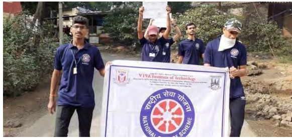
The NSS volunteers during the rally

This 7 day camp was not only beneficial for the people of the village but also for the NSS volunteers. On one side as the villagers were being made aware of various issues, diseases and importance of various social aspects, the volunteers on the other hand learned a lot regarding interaction with different kinds of people, the societal issues that existed which some of them weren't even aware of, a sense of gratitude, togetherness, rural hospitality, self development and most importantly a sense of completeness that one gets each time they do social service in any form.