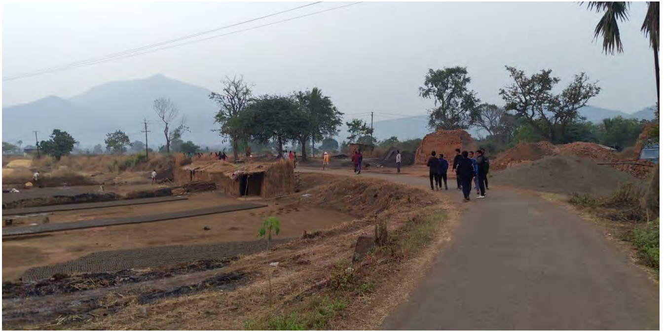
All the NSS volunteers going for the morning jog

On 30th December 2019, 7th day of the camp, the morning routine was followed as per the schedule like the previous 6 days. This included health and fitness session which consisted of a 1-hour yoga session followed by 30-min exercise.