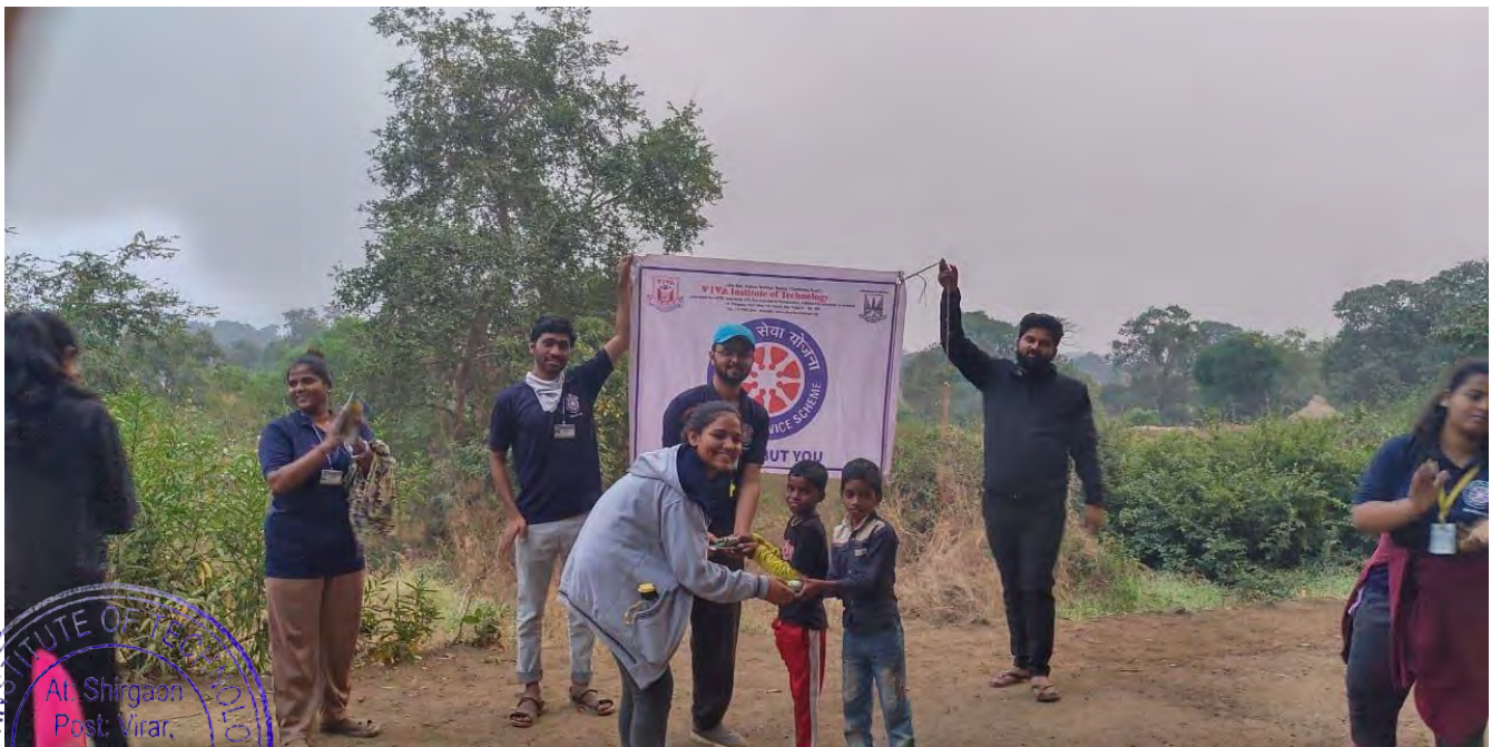
The children being rewarded by the NSS volunteers of Team Alpha