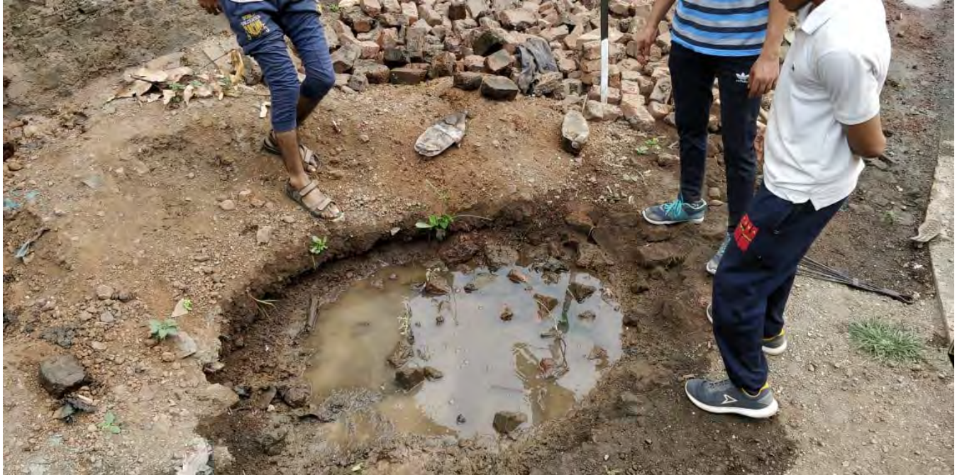
The members of Team Beta successfully dug a hole for the ease of the villagers

Digging a hole was a big task but the volunteers worked hard to complete the work on time which eventually taught all the volunteers the importance of time management combined with hard work.