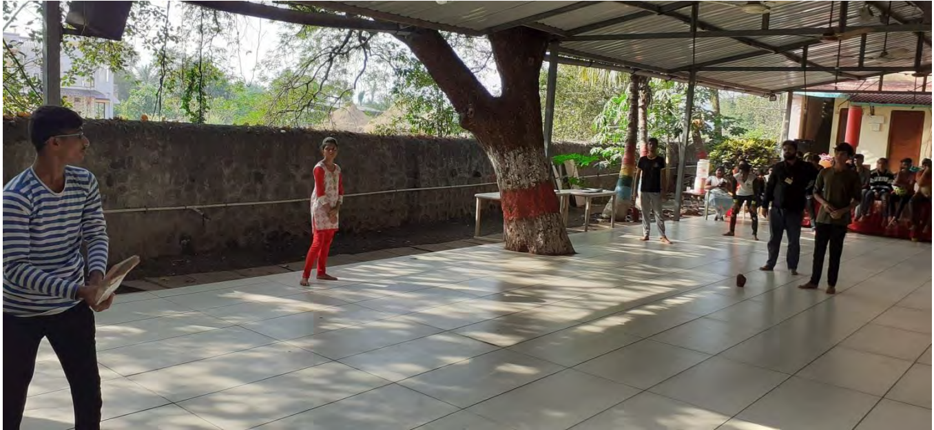
The NSS volunteers actively participating in the sports conducted by the Programming officer.

After having lunch, sports and games session was conducted for the NSS volunteers. This session included games like cricket, dodge the ball, one leg race, volleyball, etc. This session acted as a stress buster for everyone. The volunteers were very much refreshed and it eventually boosted the volunteers' energy to do more work in the forthcoming days.