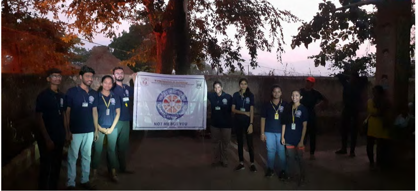
Street play on PRADHAN MANTRI GRAM SADAK YOJANA performed by the NSS Volunteers in the District Council School.

A detailed way of how one can get in contact and get access to the schemes was very cleverly depicted by the volunteers through this street play. At the end of the day the volunteers showcased their hidden talents by performing various activities. These performances included dance, singing, poetry recitation, qawwali, stand-up comedy and many more.