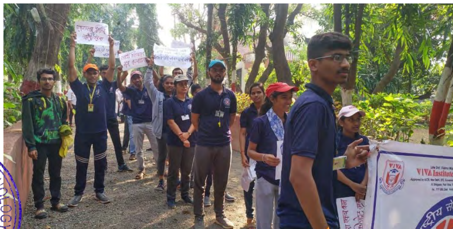
All the NSS volunteers commencing the rally

On the final day of this residential camp, Viva Institute of Technology conducted a rally in the adopted village, Bhatane.