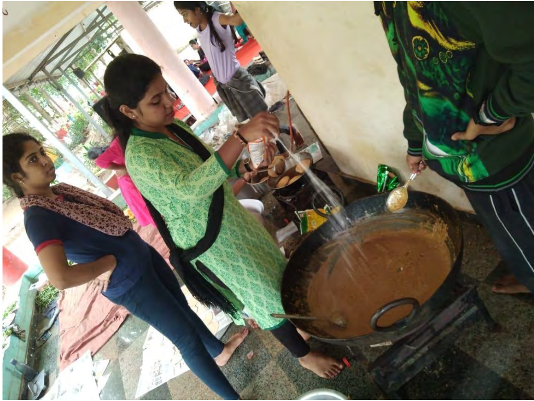
The Kitchen Team of that day i.e Team Beta preparing Lunch

On one side the Kitchen Team was busy in preparing food, the Community Service Team on the other side was engaged in conducting sports for the children of the Ashram.