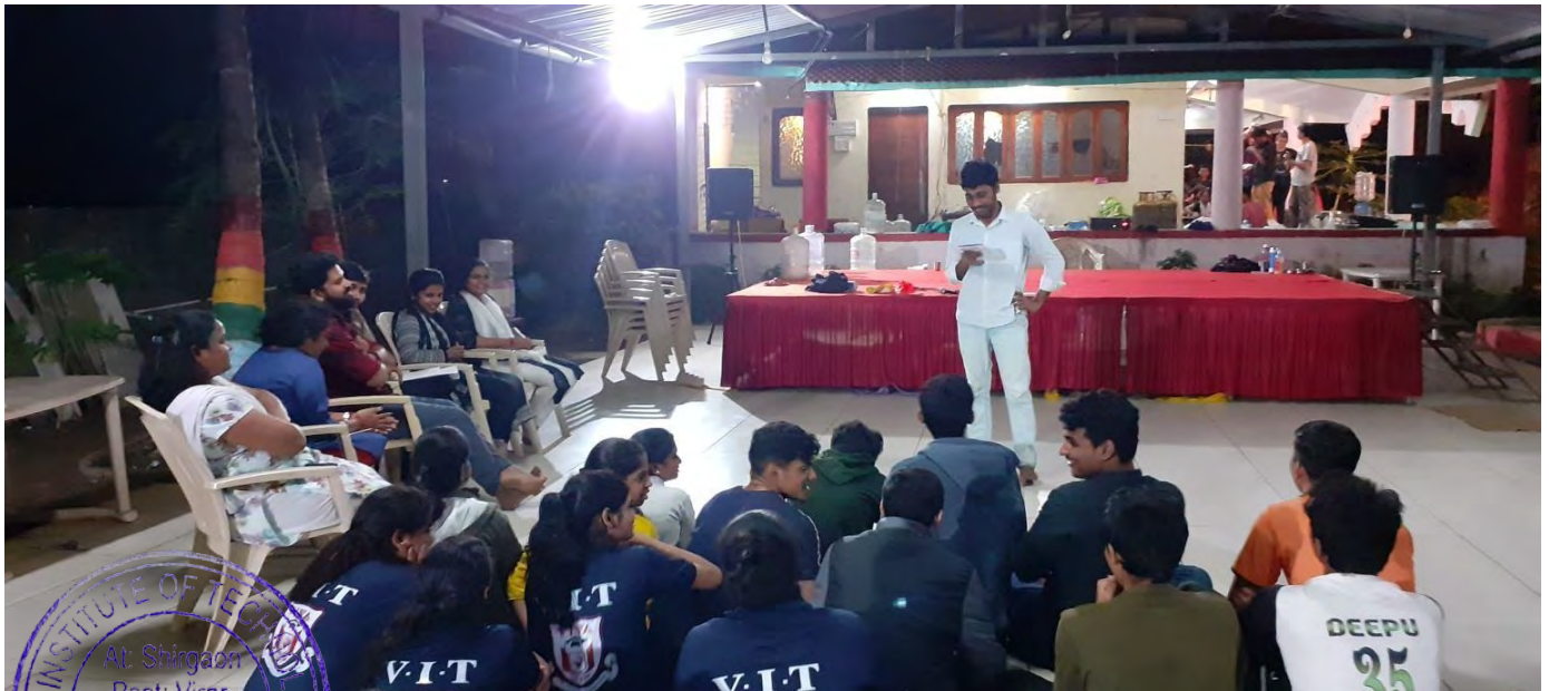
Poem recitation by the member of Team Alpha

A detailed way of how one can get in contact and get access to the schemes was very cleverly depicted by the volunteers through this street play. At the end of the day the volunteers showcased their hidden talents by performing various activities. These performances included dance, singing, poetry recitation, qawwali, stand-up comedy and many more.