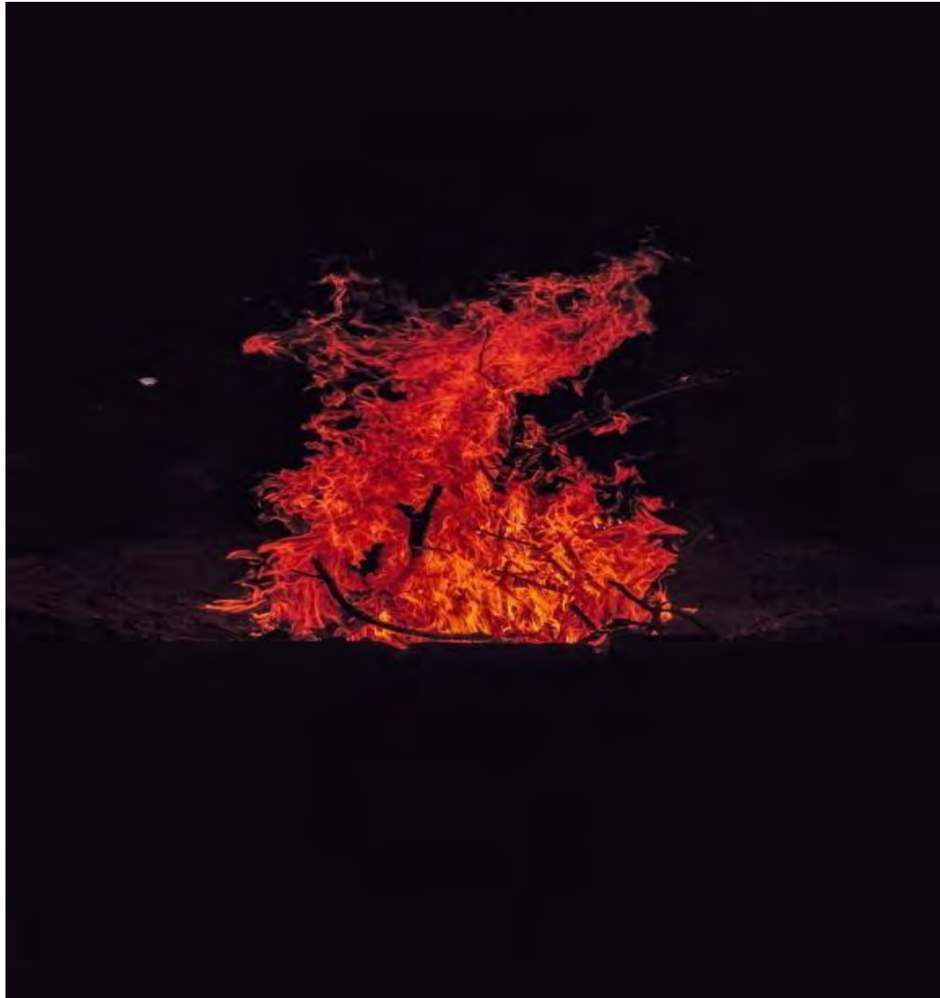
Camp fire lit up by the NSS volunteers of all teams together

After all the activities for the day, the volunteers took a little bit of rest and had their dinner earlier than usual around so that everyone could enjoy the camp fire night and the second last day ended with everyone enjoying the warmth of the fire on a cold winter night.