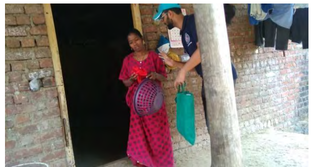
Distribution of handmade cloth bags during the rally by the NSS Volunteers