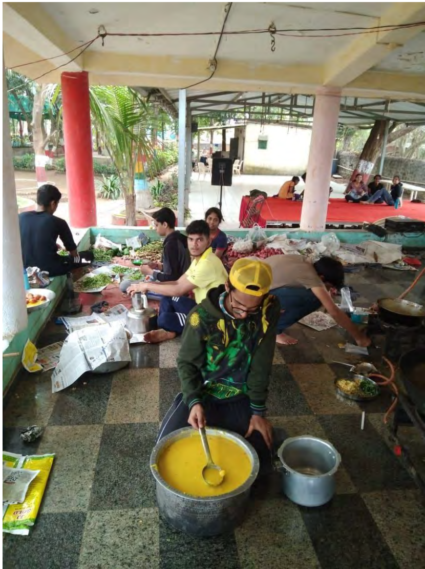
The Kitchen Team of that day i.e Team Beta preparing breakfast

The day was well started by the NSS volunteers specifically by the appointed kitchen team as today the volunteers who had attended the camp in the previous year had come to pay a visit and it was also the day of camp fire so the kitchen team was all set to prepare food for almost 70 people in place of the usual 50 people. The morning snacks being on time showed that by this time the volunteers had learned both time and resource management as well as good hospitality of their guests.