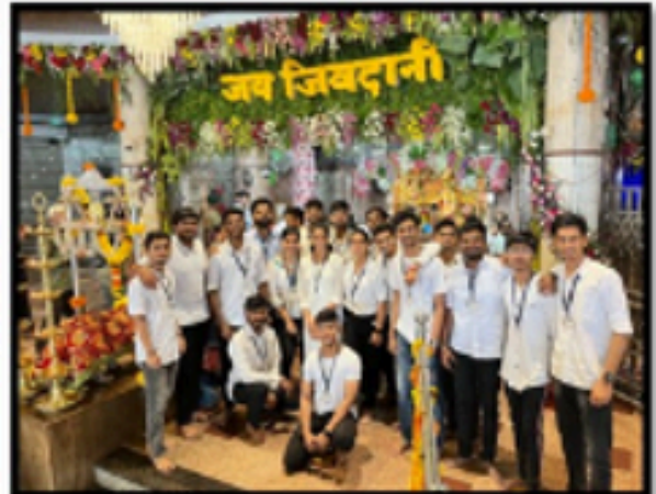
NSS Activity: Blood Donation & Jivdani Temple Social Responsibility