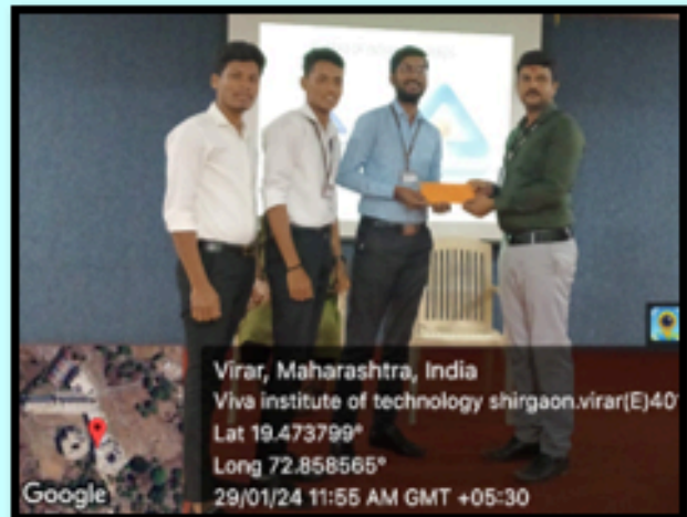
Won 1st Prize & Rs.5000/- cash Prize for BIS Standard Club Presentation - 2024