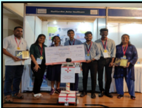
Won 1 st place in Anveshana-Building bridges to innovation competition organised by Agastya International foundation in association with Synopsys in Mumbai for project named Medicare Bot-Better Healthcare Service.