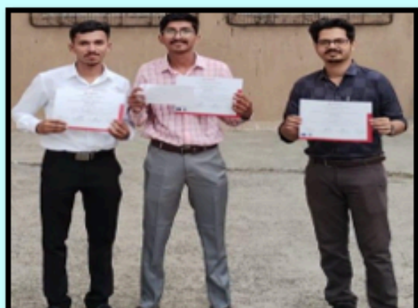
Won 2 nd Prize (Consolation) and ₹1000 cash prize for Prakalpa 23 at ICARUS at IEEE Bombay Section, Mumbai