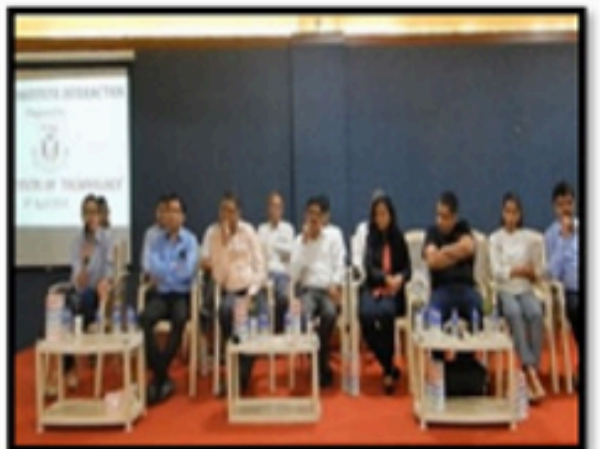
Industry Institute Interaction