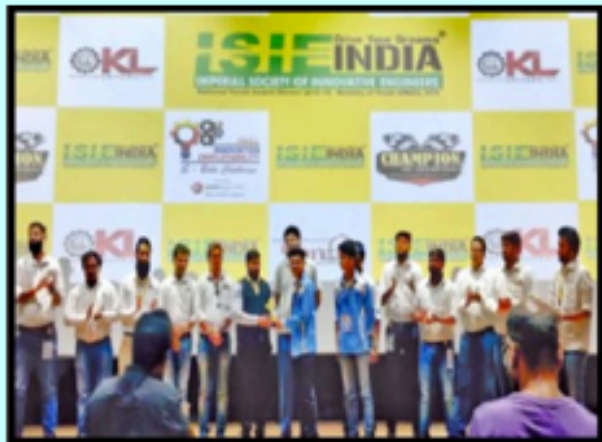
Prize on ISIE INDIA HERO ELECTRIC E-Bike Challenge at KL University