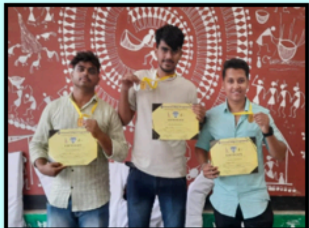
Won 1 st place in Competition Urbania, Universal college of Engineering