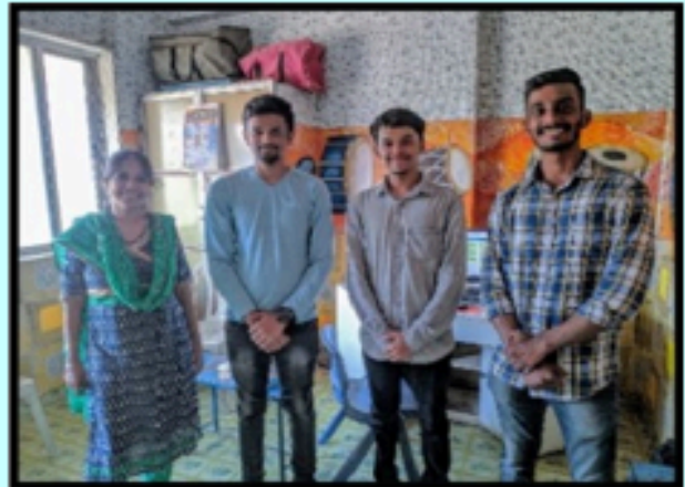
Won 2 nd Prize & Rs. 15,000 Cash Prize for National Level Technical Conclave