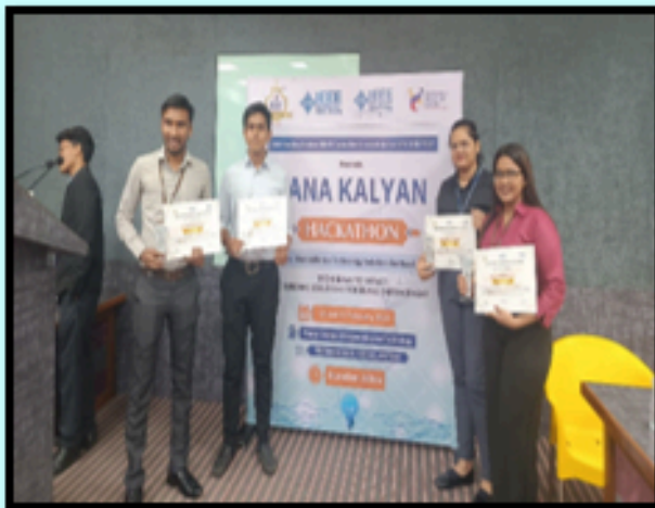
Top 5 in JANA KALYAN HACKATHON organised by TCET in association with IEEE BOMBAY section