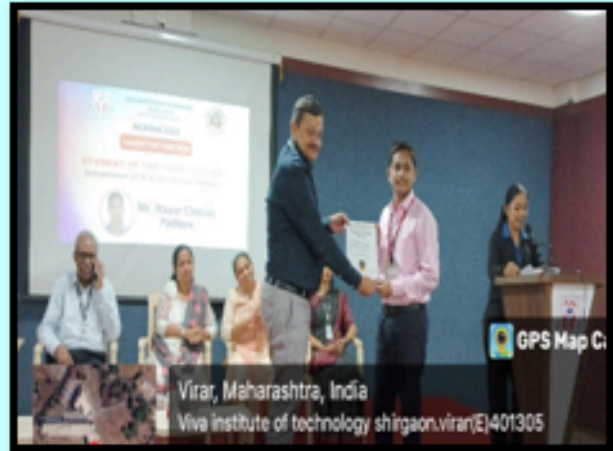
Won 2 nd Prize in Paper Presentation at National Conference (NCRENB) – 2024