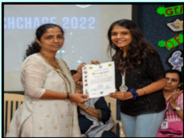
Won 2 nd rank in Debate Competition (Hindi & English), zone 5, 55 th inter college youth festival, Churchgate Mumbai - 23