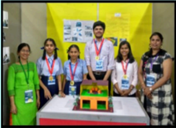
Won 1 st Prize & Rs. 30,000 Cash Prize for Project titled "Smart Room", Anveshana Science & Engineering Fare