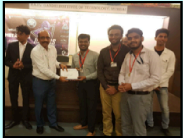
Won 1 st Prize and ₹500 cash prize for Project Competition at ICARUS at Rajiv Gandhi Institute of Technology, Mumbai