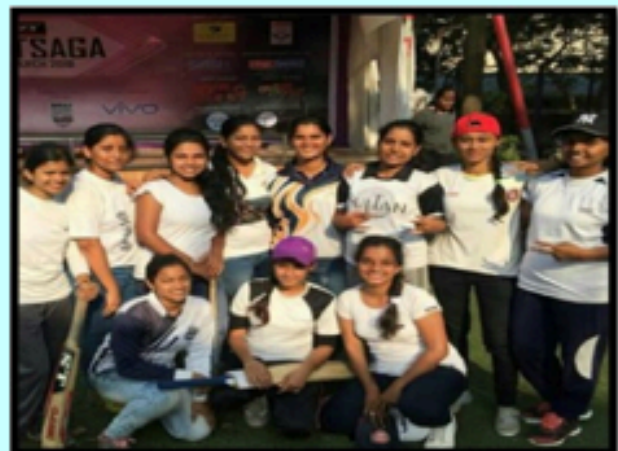
Won 2 nd prize in Intercollege Cricket.