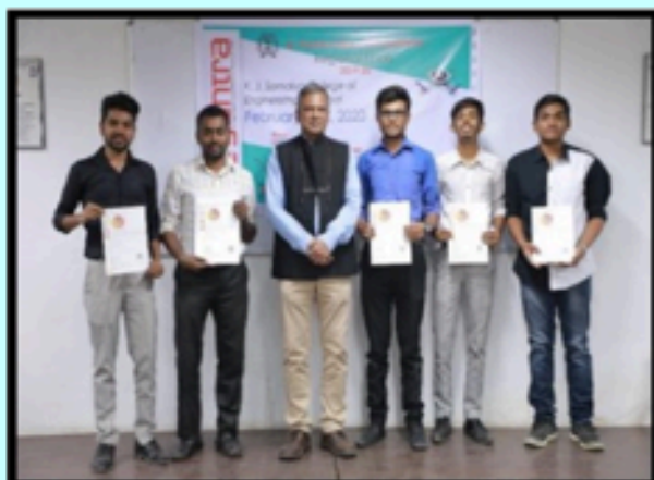
Won ₹5000 cash prize & selected for National Finals @IIT Bombay, Sponsored by MHRD, Govt. of India under NMEICT