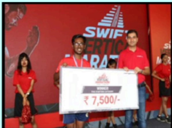
Won Gold Medal in Vertical Marathon at Maruti Suzuki in Cuf parade, Colaba