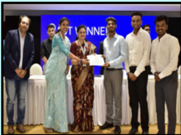
Won 1 st Prize and ₹5000 cash prize for Project Model Exhibition at ICARUS at IEEE Bombay Section, Mumbai