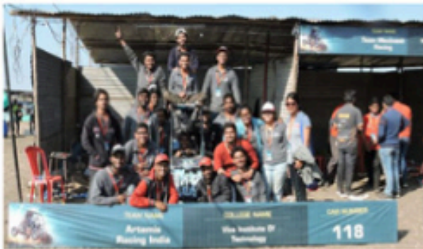
All Terrain Vehicle team-"Artemis"