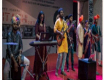
Cultural fest "Hitaishi"