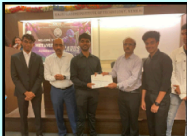
Won 2nd Prize for Technical Fest ICARUS, held at Rajiv Gandhi Institute of Technology, Mumbai – 2023