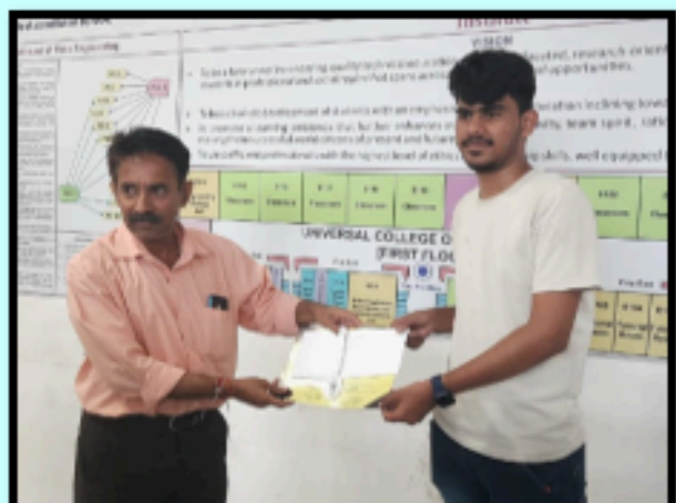
Won 3 rd place in Rapid Survey VYRO Tech-Fest, Vasai