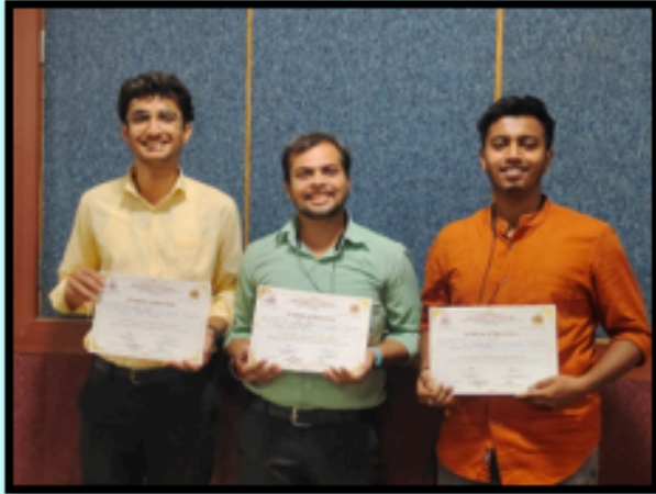
Won 1st Prize in Paper Presentation at National Conference (NCRENB) – 2024