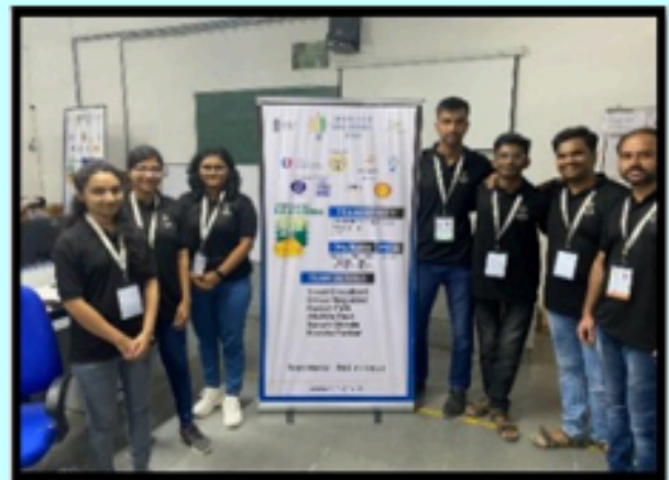
Smart India Hackathon 2022