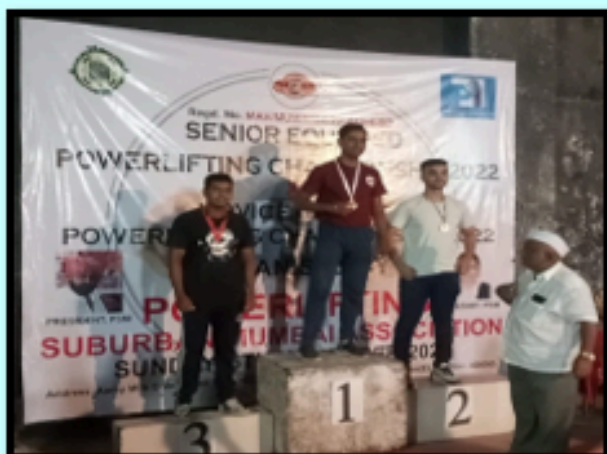
Won 3 rd place in NOVICE classic power lifting Championship – 2023