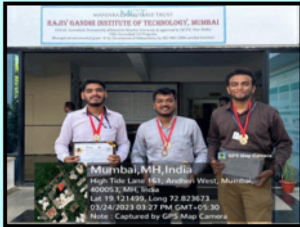
Won 1 st Prize and ₹500 cash prize for Poster Competition at ICARUS at Rajiv Gandhi Institute of Technology, Mumbai