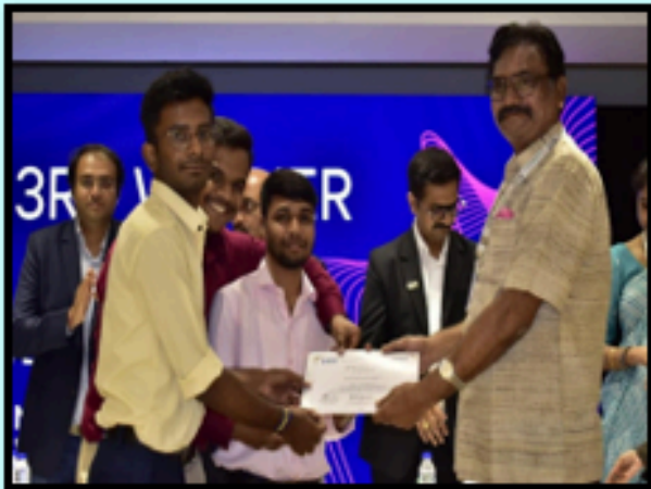
Won 3 rd Prize and ₹2000 cash prize (after participating at final round) for TECHNOVATION – 2023