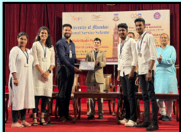
Appreciated by University of Mumbai TO NSS Unit for maximum Blood Units Collected during COVID & Post-COVID