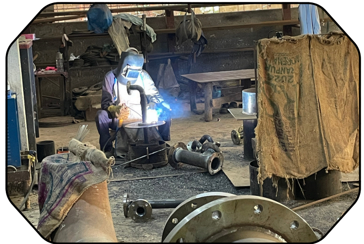
Faculty industrial Visit at "Paresh Engineering Industries", Virar On 30 th November 2024