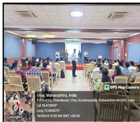
Guest Lecture on “BUILDING BRIDGES: EXPLORING CAREER PATHWAYS IN DEFENCE TECHNOLOGY” held on 16 th August 2024