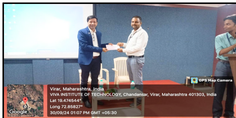
Guest Lecture on “ENGINEERING SUCCESS: FROM EMPLOYABILITY TO ENTREPRENEURSHIP” held on 30 th September 2024