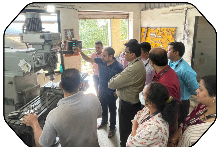
Faculty industrial Visit at "Preciword Mechanicals", Virar (East) On 30 th November 2024