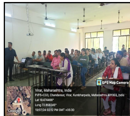
Guest Lecture on “INNOVATIVE AUTOMATION: ROBOTICS IN INDUSTRY 4.0” held on 19 th July 2024.