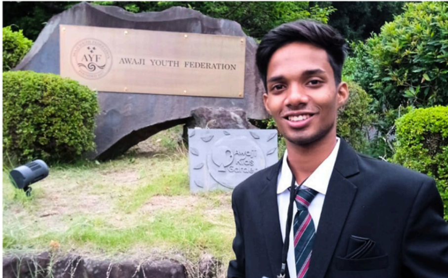
Worked on a Tourism IOS Application Project